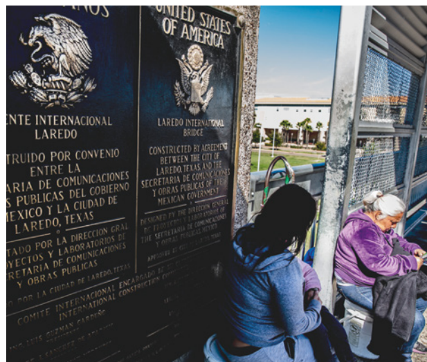
Asylum seekers wait at the international bridge between Nuevo Laredo, Tamaulipas, Mexico, and Laredo, Texas, to apply for protection in the US.

branches of the same gangs and criminal organizations that forced them to flee their homes to start with—means that they are exposed to further cycles of violence, kidnapping and abuse. Asylum seekers also face problems of integration, discrimination, and lack of access to the public health system. 75 Moreover, there are serious concerns over the administrative capacity of these third countries to adequately manage the increased number of asylum cases. 76