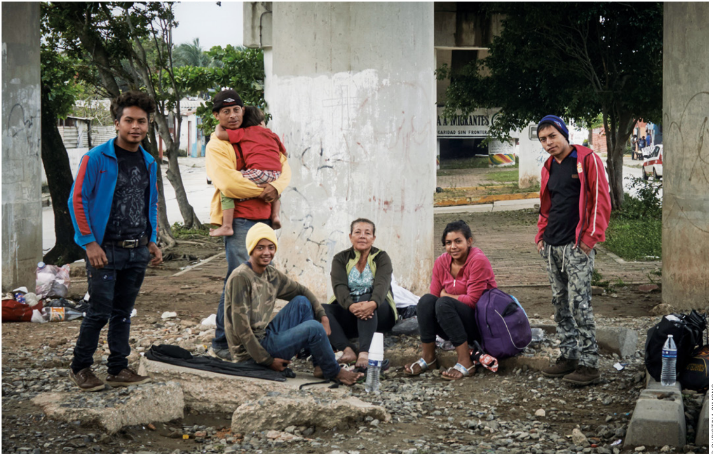
A Honduran family travelling north makes a stop in Coatzacoalcos, Veracruz, Mexico.