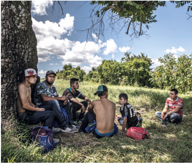
A group of migrants rests after crossing the border from Guatemala into Mexico, near La 72 shelter in Tenosique.

The criminalization of migration has been accompanied by reports of inhumane treatment in detention centers. 51 Many of MSF's patients in Mexico report having been detained in deplorable conditions in the US, 52 sometimes in frigid cells (described in Spanish as hieleras , or "freezers") for weeks on end, 53 with the lights turned on 24 hours a day, with limited access to health care, and without adequate food, clothing and blankets.