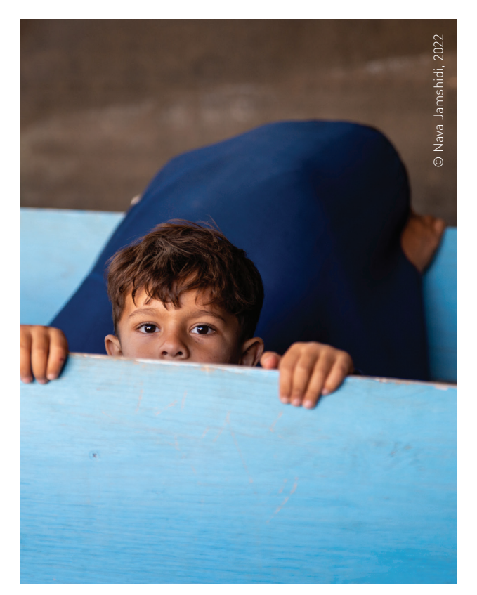
A mother and her son in the waiting area of MSF's outpatient department in the Kunduz Trauma Centre, Kunduz Province, Afghanistan. On average, MSF teams in Kunduz provide outpatient medical consultations to 1,400 patients a month.

Aid organisations have become the de facto substitute for the public health sector, a role that cannot be sustainably filled by international actors and particularly when it involves decisions affecting policies and improvements of Afghanistan's health system. Humanitarian actors should not remain attached to political constraints, and should not have to be responsible for keeping Afghanistan's health system on life support indefinitely either.